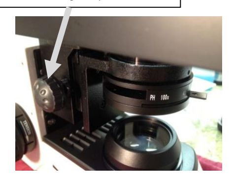
Condenser Height Adjustment Knob