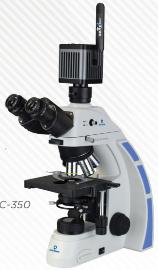
Shown on an EXC-350