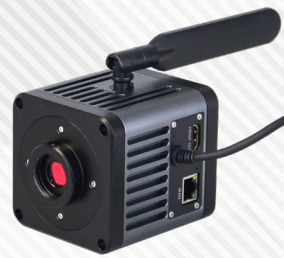
Uses a standard C-mount (0.35x recommended)